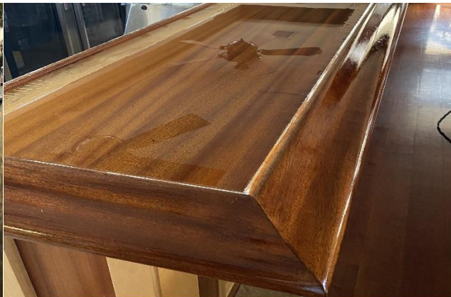
3 rd Floor bar top facelift